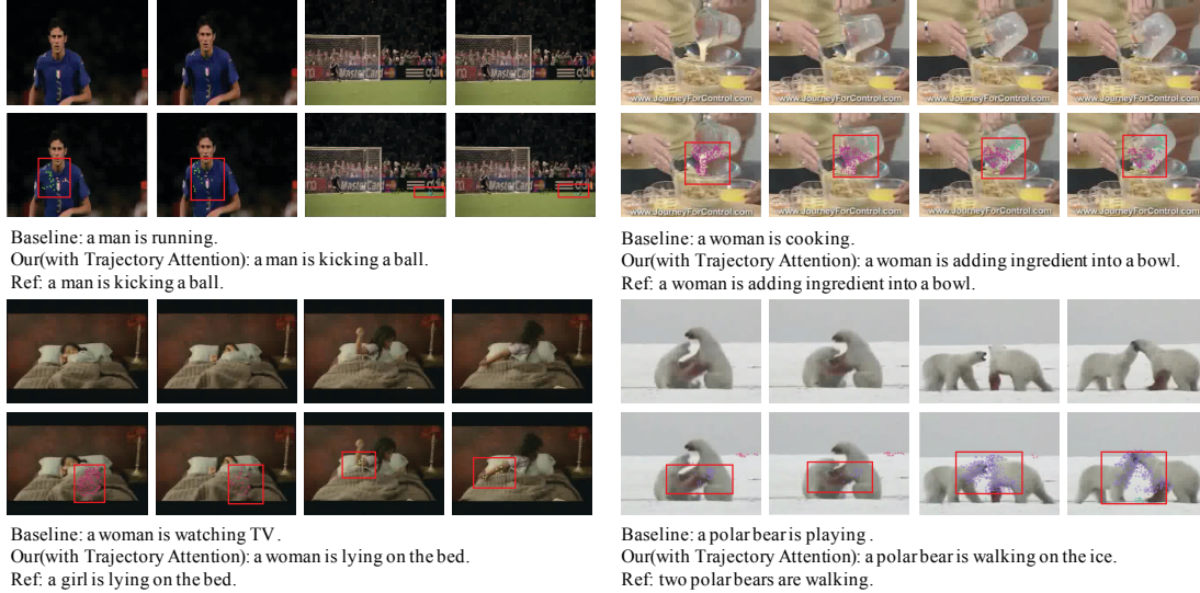
Figure 2. Four sample videos and their corresponding generated and ground-truth descriptions. The middle images in each panel shows the visualization results of our attended trajectory clusters, we use the red rectangle to mark the attended clusters.

draw all the extracted trajectories on the video, with different trajectory clusters being labeled with different color. The trajectory visualization result of each sample video is also listed in Figure 2. As shown in the figure, our proposed TSA-ED framework can accurately capture the salient motion parts while generating more elaborate video captioning. For each generated statement, we can usually locate explanatory trajectory data to support our prediction. For example, when generating the caption “adding ingredient into a bowl” in the top-right of the figure, the most salient trajectory clusters attended by our algorithm is exactly the “pouring” action in the video. Indeed, the proposed attentive trajectory localization mechanism provides an effective visualization tool for video captioning and thus can greatly enhance the model’s interpretability.